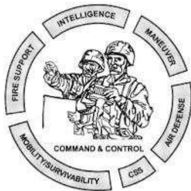
Figure 3. Battlefield Operating System.

The influence of air power on ground combat, with regards to the concept of close air support and other tactical air mission like reconnaissance, intelligence, surveillance, which constitute amongst a part of, and also enhances other parts of battlefield operating system, like survivability and maneuverability adds strategic, operational, and tactical flexibility to surface force combat power effectiveness.