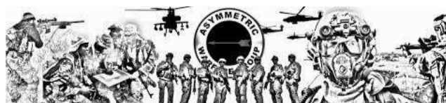
Asymmetric Threat Environment

Also, the air force does not argue that the army does not require tactical airpower or close air support to meet its field operational requirement, what is argued, however, is that such mission does not require the decentralization of tactical air command and control to army division, brigade, and battalion level. But should be under the control of an air force combatant command. On this notion, the army argued that often the airforce falls short of delivering tactical air task order or close air support at the critical moment required. A delay in meeting close battle air strikes and fire support requirements can be dangerous to combat troop's safety. Metele attack speaks volume of the need of air/land synchronized combat power, which in essence should help combat unit in distress to survive battle damage in a manner that still preserve force cohesion, and the ability to gain ground and hold terrain. The absent of airpower support to 157 Battalion in Metele northern Borno was a disaster in the history of Nigeria's counterinsurgency operation. This research is of the strong opinion that in a fluid and time-sensitive military operating environment, air task orders that support the army's mission task should be permanently synchronized with the army battle groups.