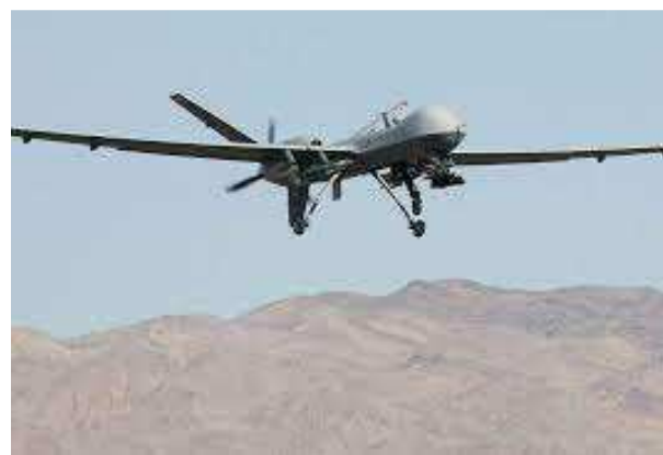
Drone Reconnaissance, Strike/ Fire Complex Combat System

Therefore, Nigerian army does not only need to control airpower for close air support and other tactical mission requirements, but need to also control some level of airpower logistic to enable swift maneuverability of forces in the area of operation and interest.