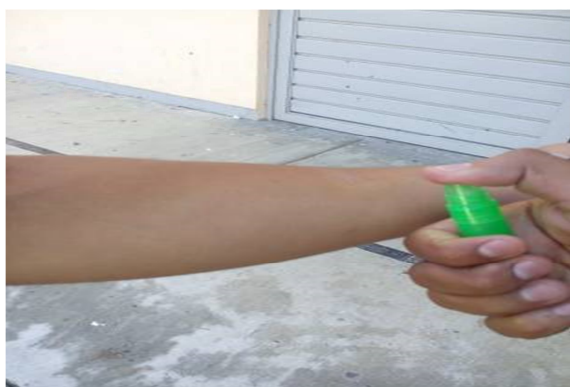
Figure 3. Tolerance test of the skin application repellent.

With these formulations, a test was carried out using glass vials (with 15 mosquitoes in each vial), an absorbent cotton impregnated with sample was introduced, as shown in Table 2.