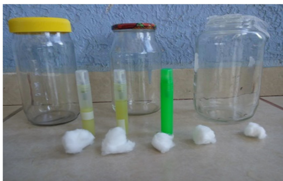
Figura 2. Bioassay and repellency.

Three formulations of the repellent spray (identified as #1 with 9% of each oil, #2 with 4.5% of each oil and #3 with 4.5% lemon tea extract, 13.6% of pumpkin seed and 9% of castor seeds) were tested for duration and effectiveness to choose the best formulation (Figure 2). Separation of the oils was observed due to the composition of the mixtures in formulations #2 and #3, formulation #1 remained stable. It was observed that the time or duration of the effect of the samples was variable, the formulation that prevailed most was #3, lasting 5 hours; formulation #2, 2 hours; and the #1, 4 hours.